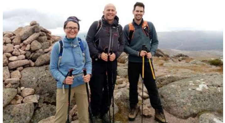
The summit of Bynack More & the other Ptarmigan Group who took a different route up