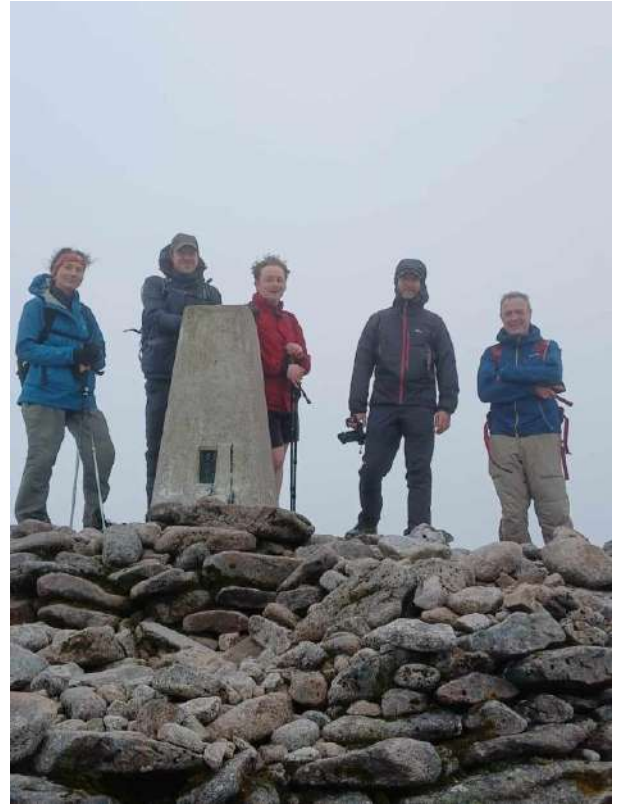
Ptarmigan group on Ben Macdui