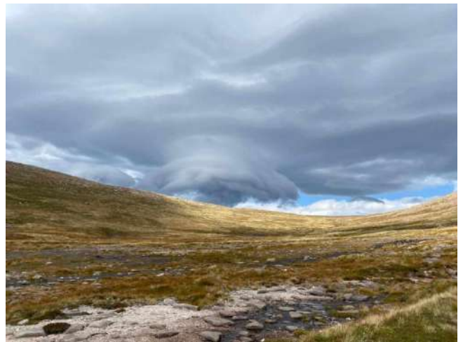
Lunch spot at Loch Avon & an extraordinary tubular cloud shape: Pictures by Cherie Hamoudi