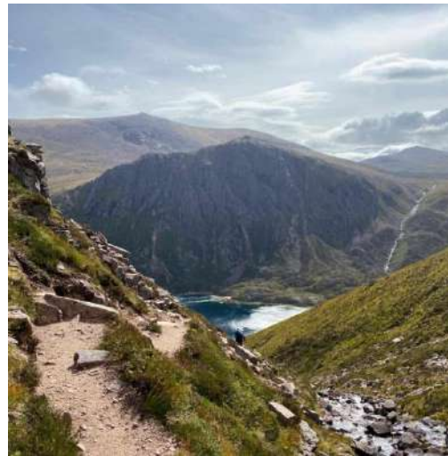
Ptarmigans on the Cairngorm Plateau & on the descent to Loch Avon